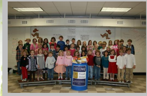
Your organization can reach out to over 600 families in the Buckhead area.